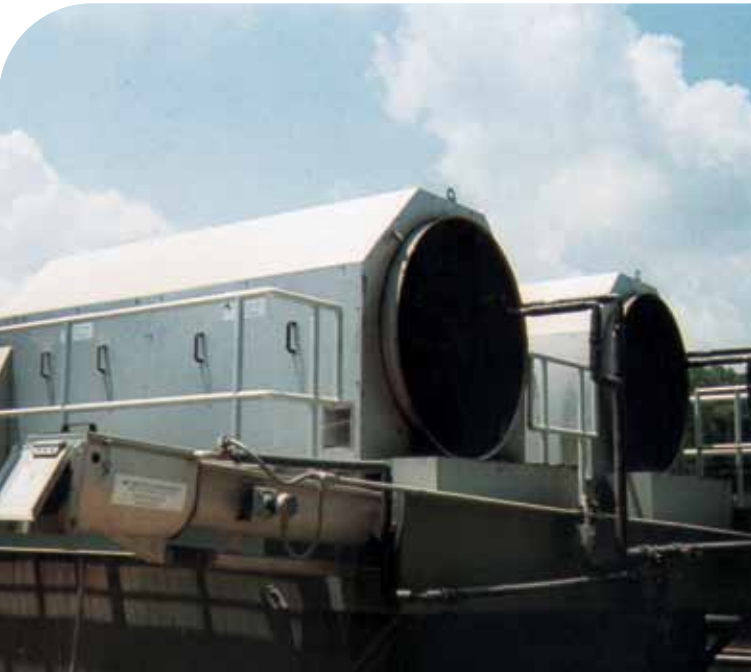
Wedgewire construction maximizes capture